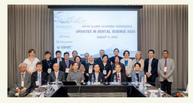
Representatives from the attending countries