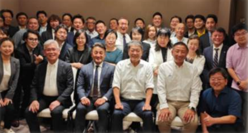
Japan Dental Trade Assoc. get together